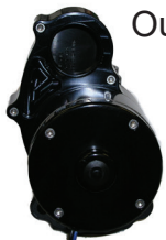
Outlet Higher Correct

This pump can use any of our “WN” style fittings for the inlet and outlet ports as well as for the bypass port. The sizes range from 1 1/4 to 1 3/4 rubber hose and -12AN to -24AN for braided hose. Typically, we will recommend the largest feasible size for the inlet and outlet and about a 5/8” to 3/4” fitting for the bypass. The fittings seal to the pump with an o-ring seal. Use a little grease or oil to lubricate the o-ring before installing the fitting.