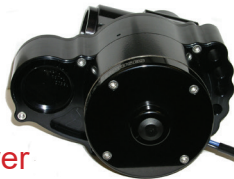
Outlet Lower Incorrect